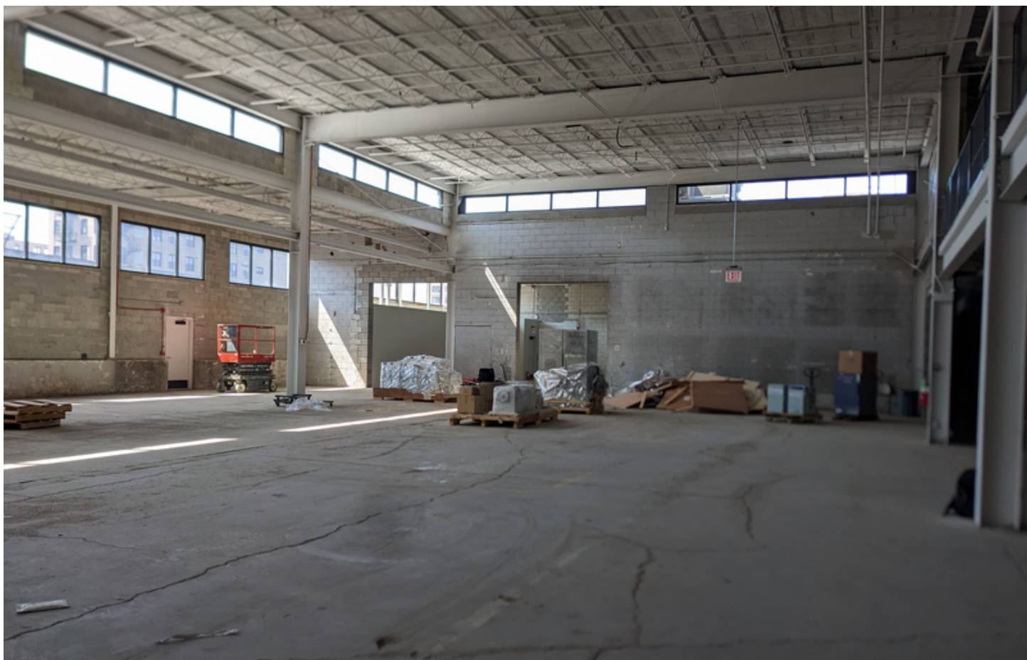
An image of the building interior before Barstool's buildout.