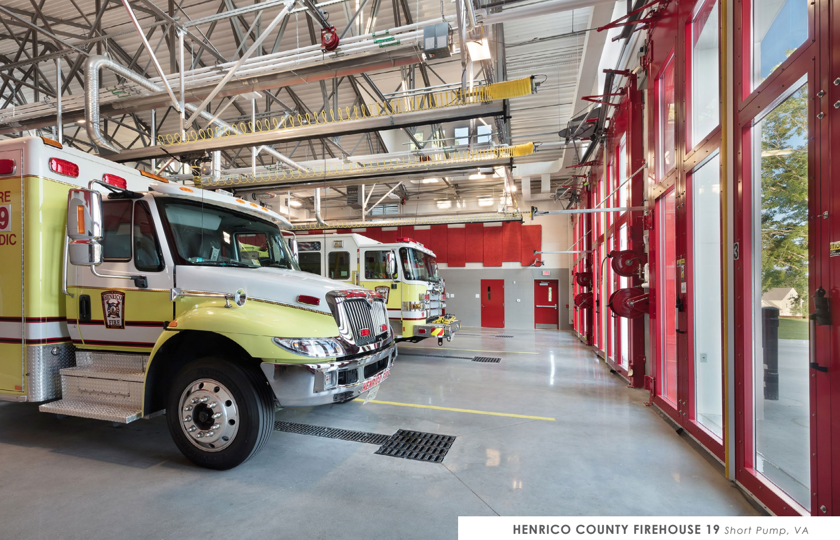
HENRICO COUNTY FIREHOUSE 19 Short Pump, VA