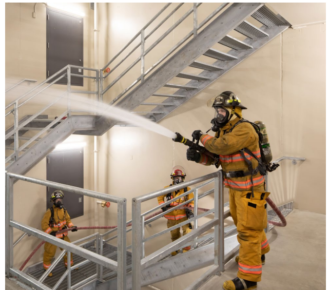
FRIDLEY CIVIC CAMPUS Fridley, MN