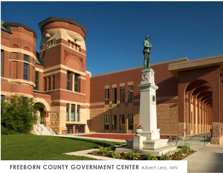
FREEBORN COUNTY GOVERNMENT CENTER Albert Lea, MN