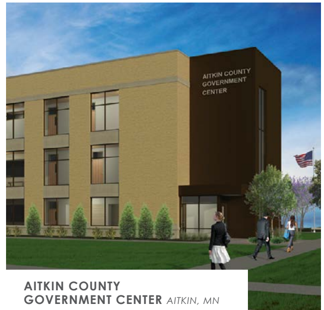
AITKIN COUNTY GOVERNMENT CENTER AITKIN, MN