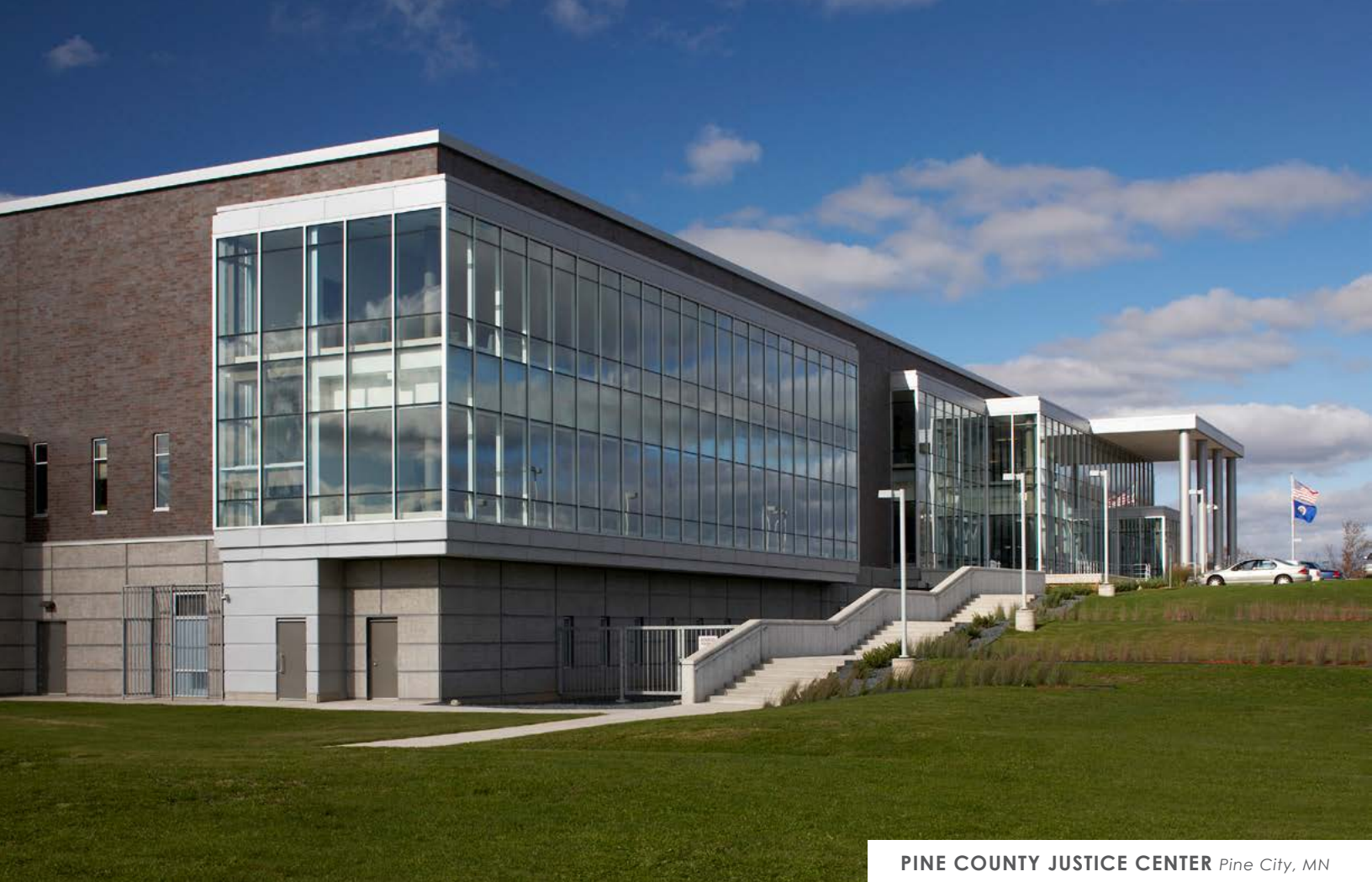
PINE COUNTY JUSTICE CENTER Pine City, MN