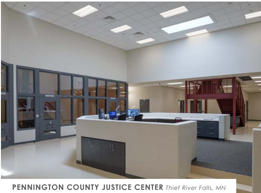
PENNINGTON COUNTY JUSTICE CENTER Thief River Falls, MN

BKV Group is dedicated to working with counties to responsibly and effectively build facilities that speak to the heart of the community. A key component of public project implementation is often funding and community support. Lack of community support may be attributed either to a plan, which does not adequately understand the needs and vision of the community, or a plan which has been poorly understood by the community. Our team utilizes a wide range of tools in determining community opinions as well as disseminating the critical supportive information to educate the public on the project concept. BKV Group understands successful public design extends beyond the building's walls and into the broader context of community.